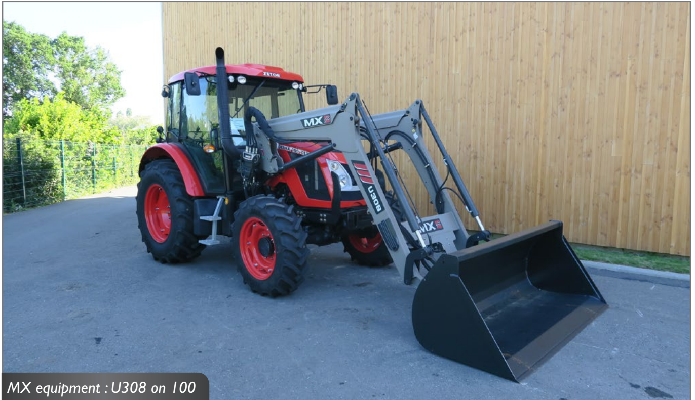
MX equipment : U308 on 100