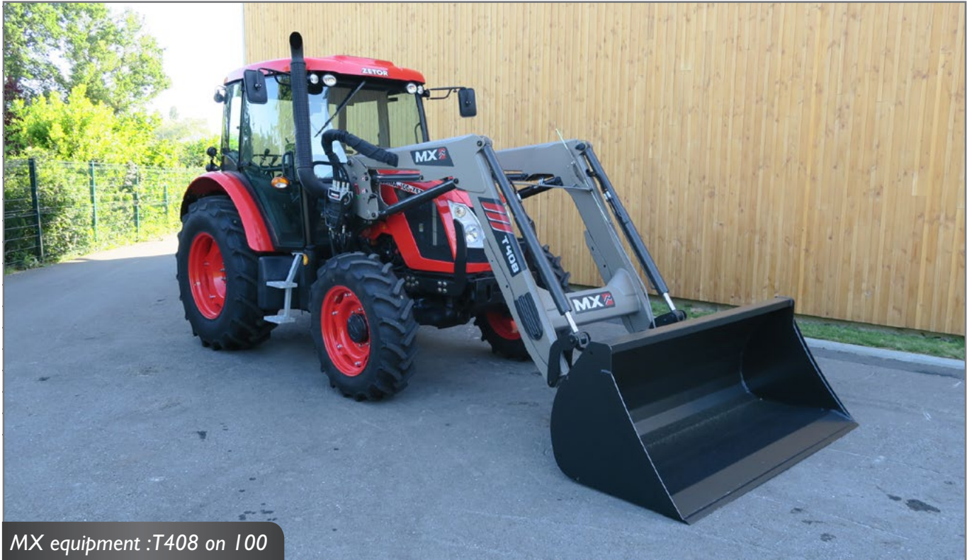
MX equipment : T408 on 100