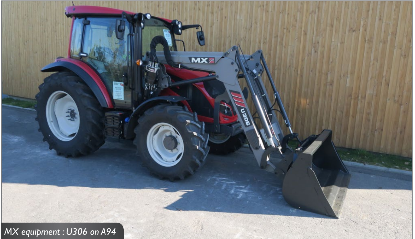
MX equipment : U306 on A94