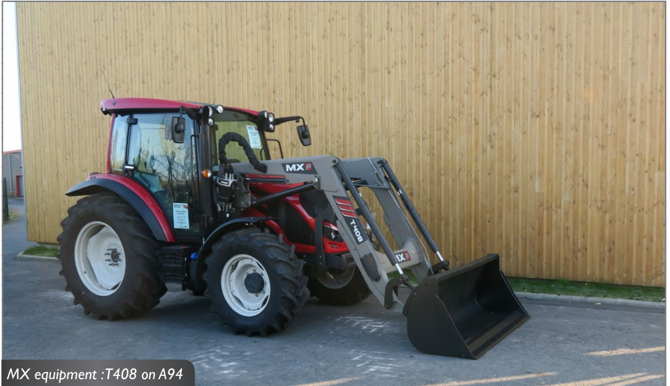
MX equipment : T408 on A94