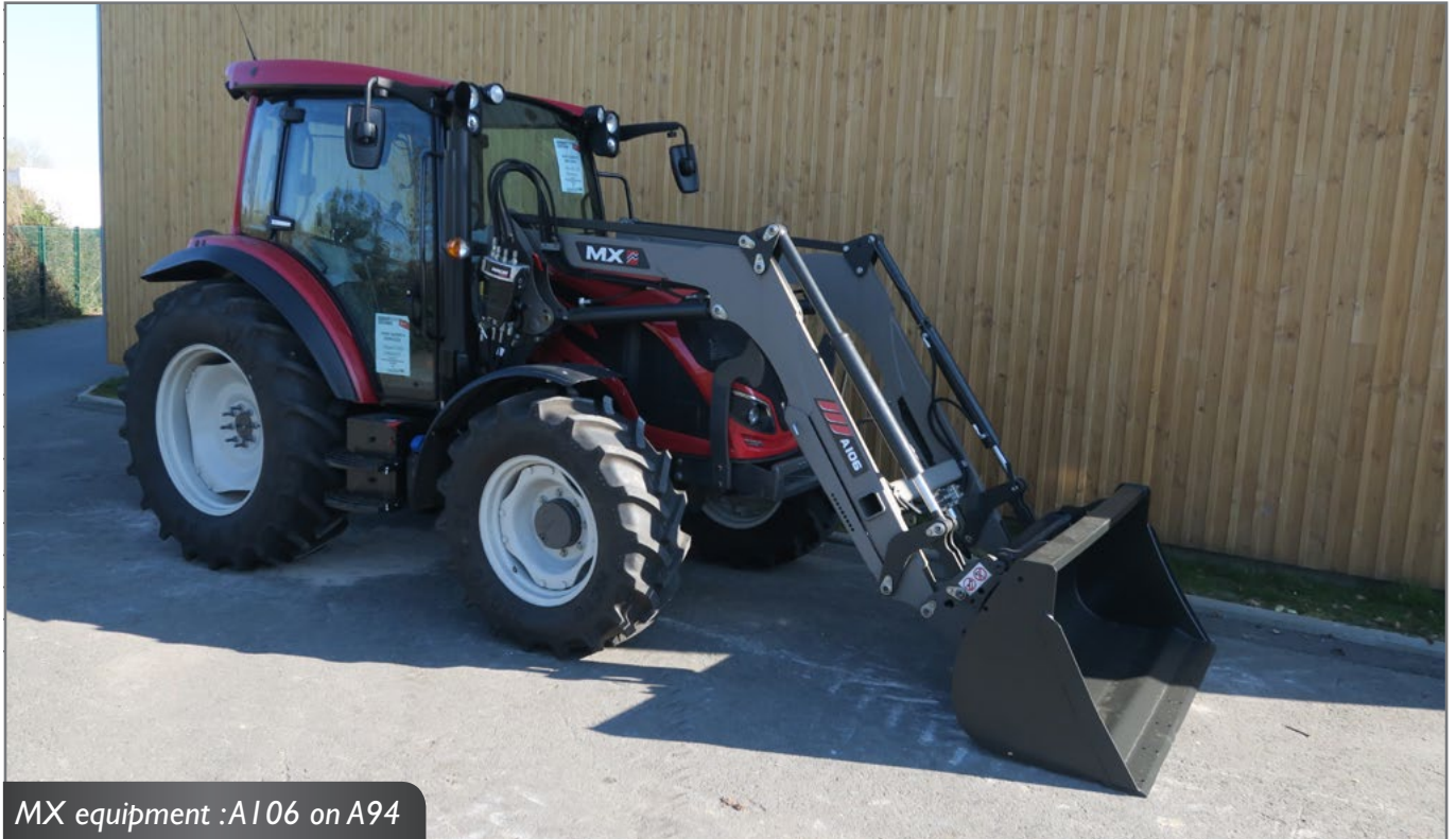
MX equipment : A106 on A94