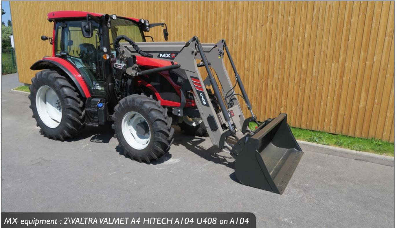
MX equipment : 2\VALTRA VALMET A4 HITECH A104 U408 on A104