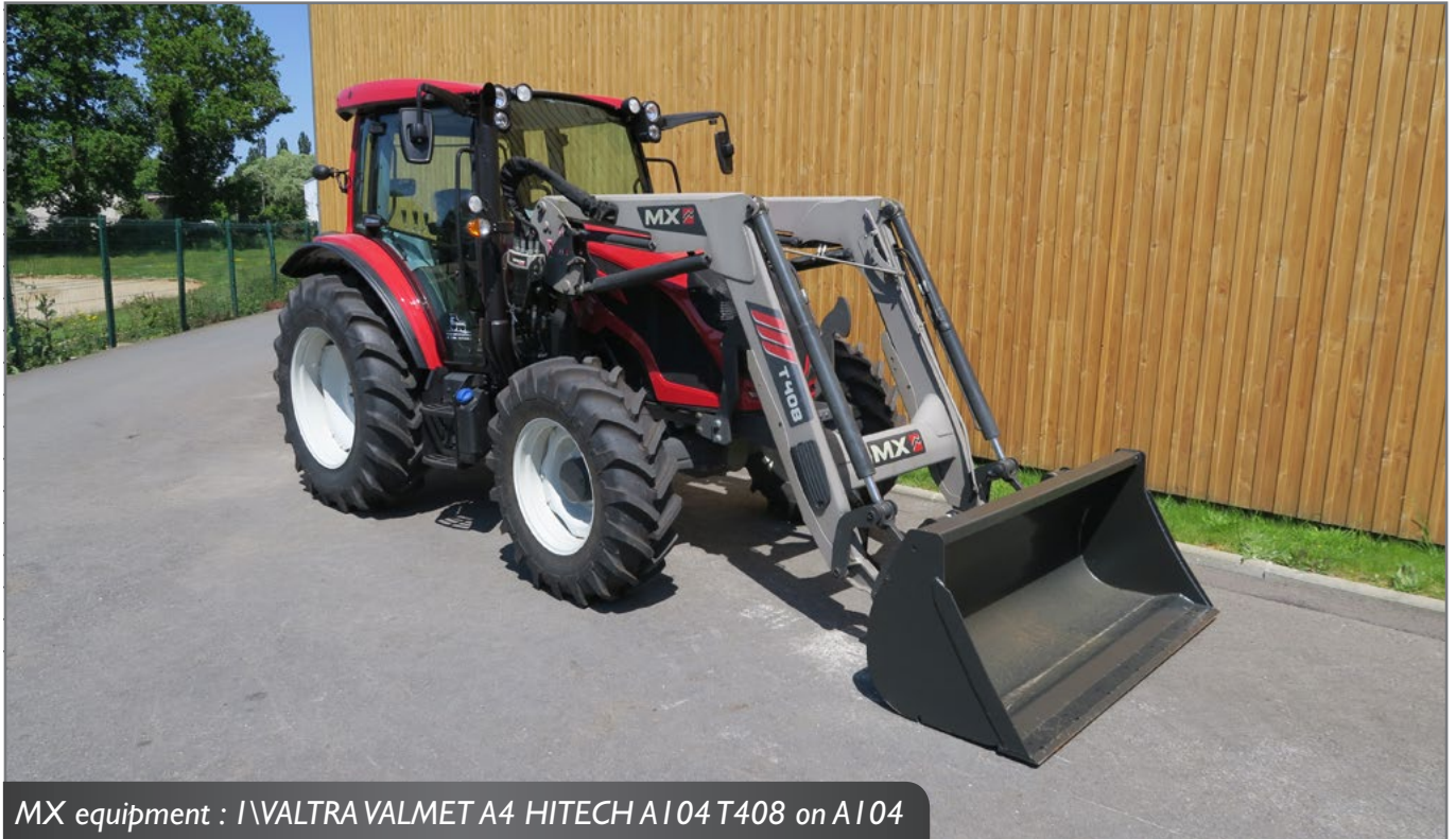
MX equipment : | VALTRA VALMET A4 HITECH A104 T408 on A104