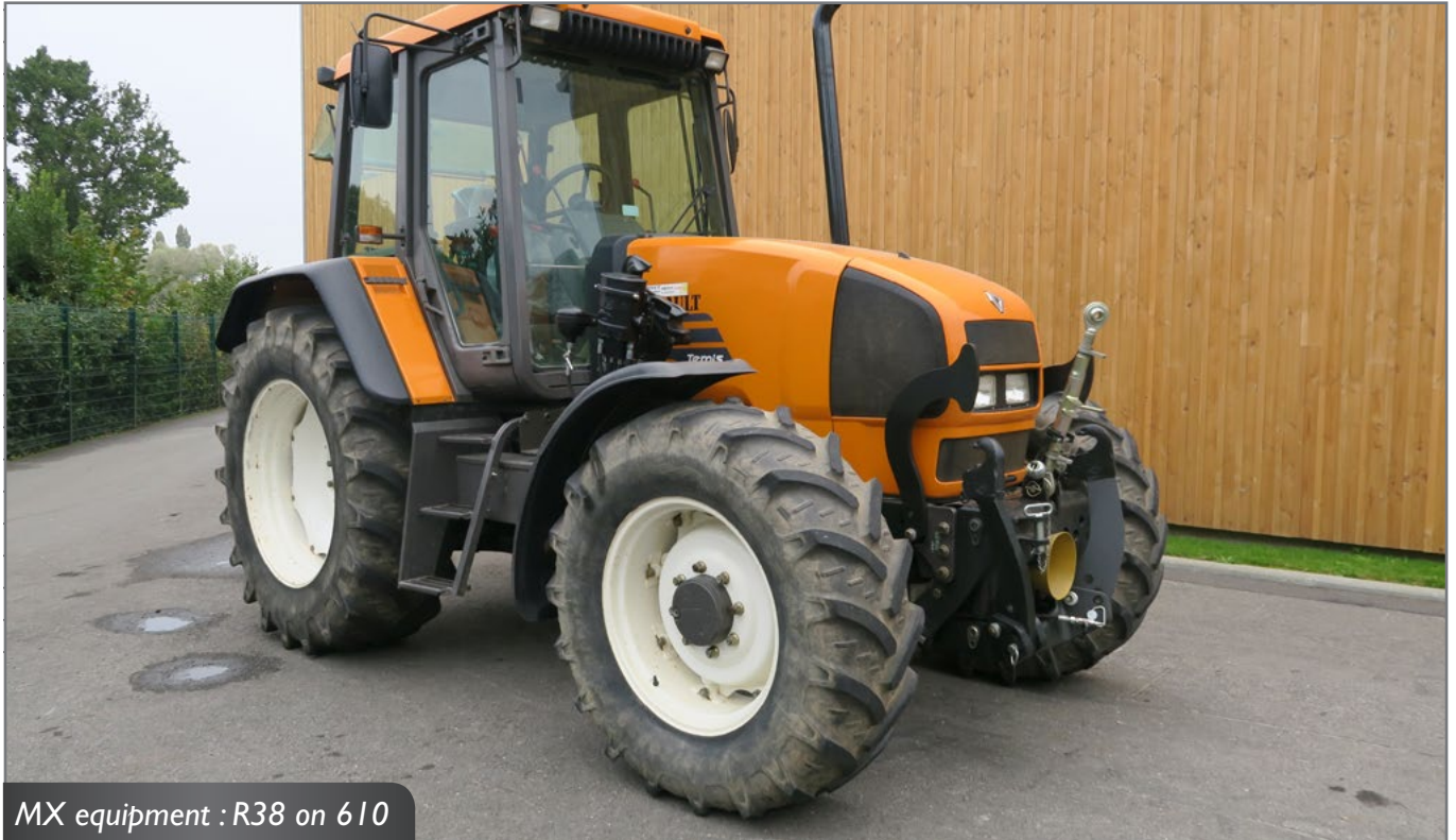
MX equipment : R38 on 610