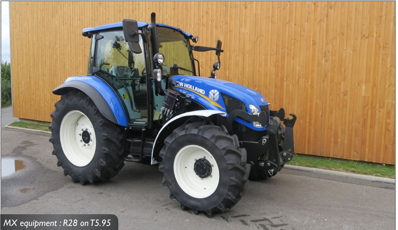
MX equipment : R28 on T5.95