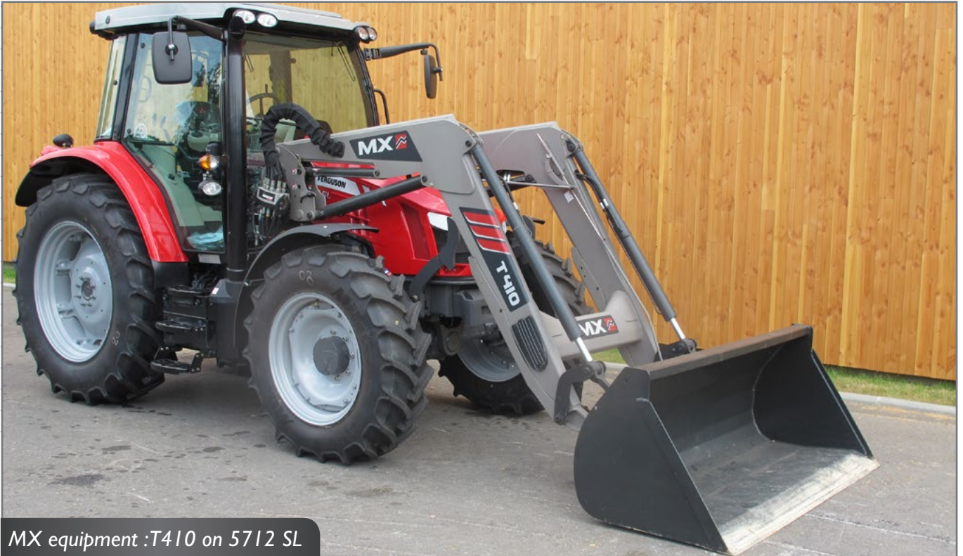
MX equipment : T410 on 5712 SL