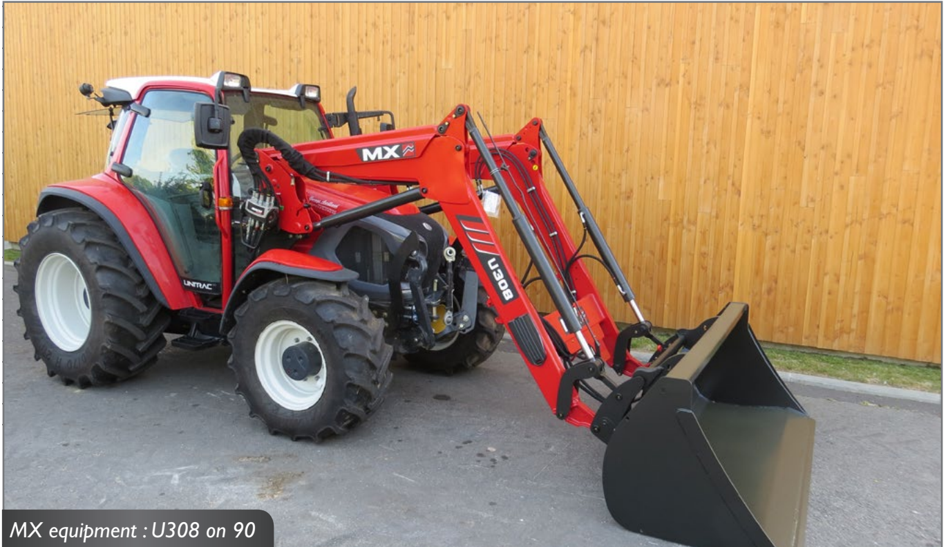
MX equipment : U308 on 90