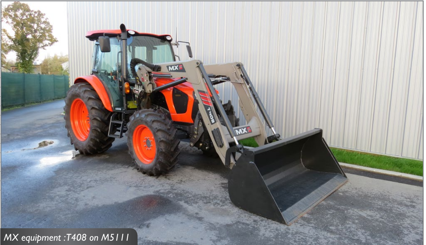
MX equipment : T408 on M5111