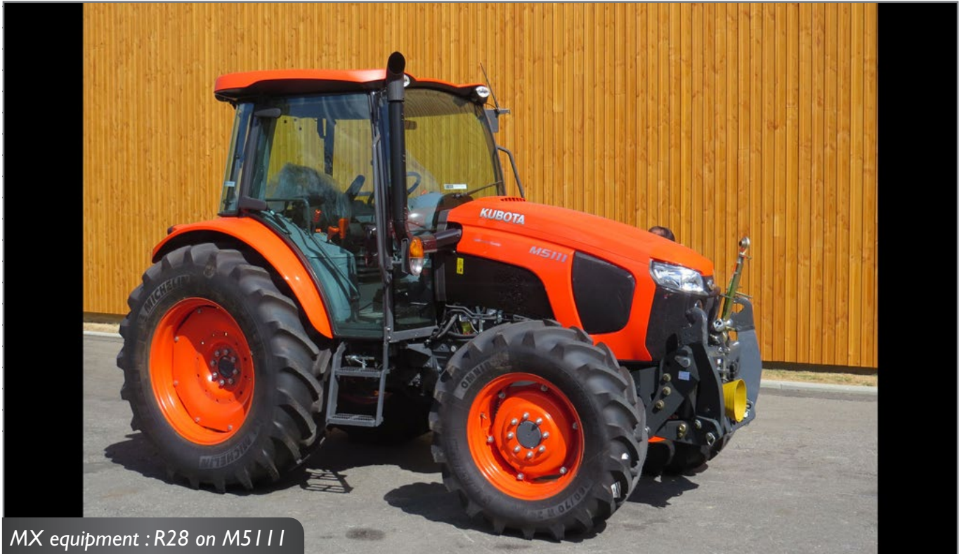
MX equipment : R28 on M5111