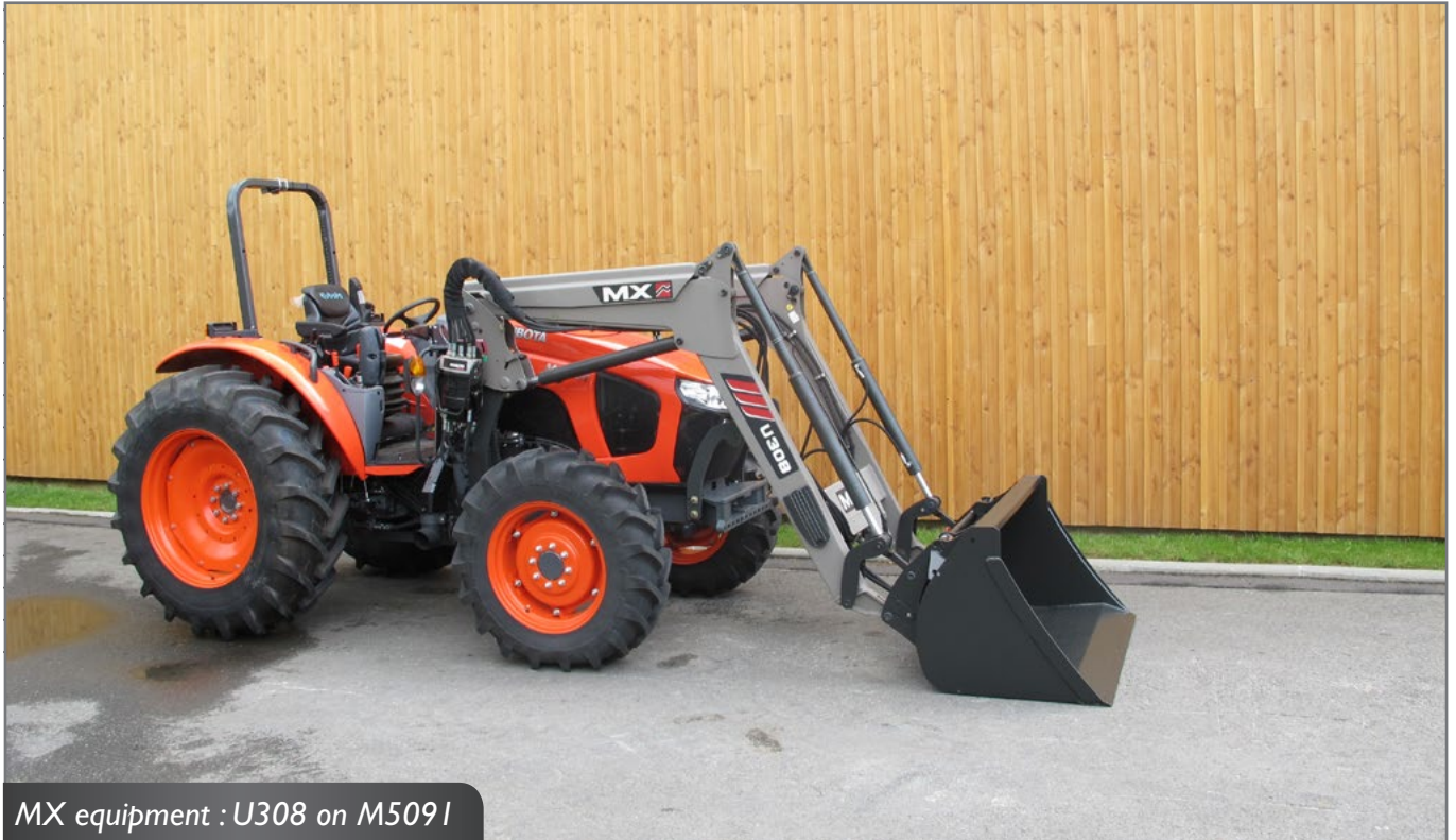
MX equipment : U308 on M5091