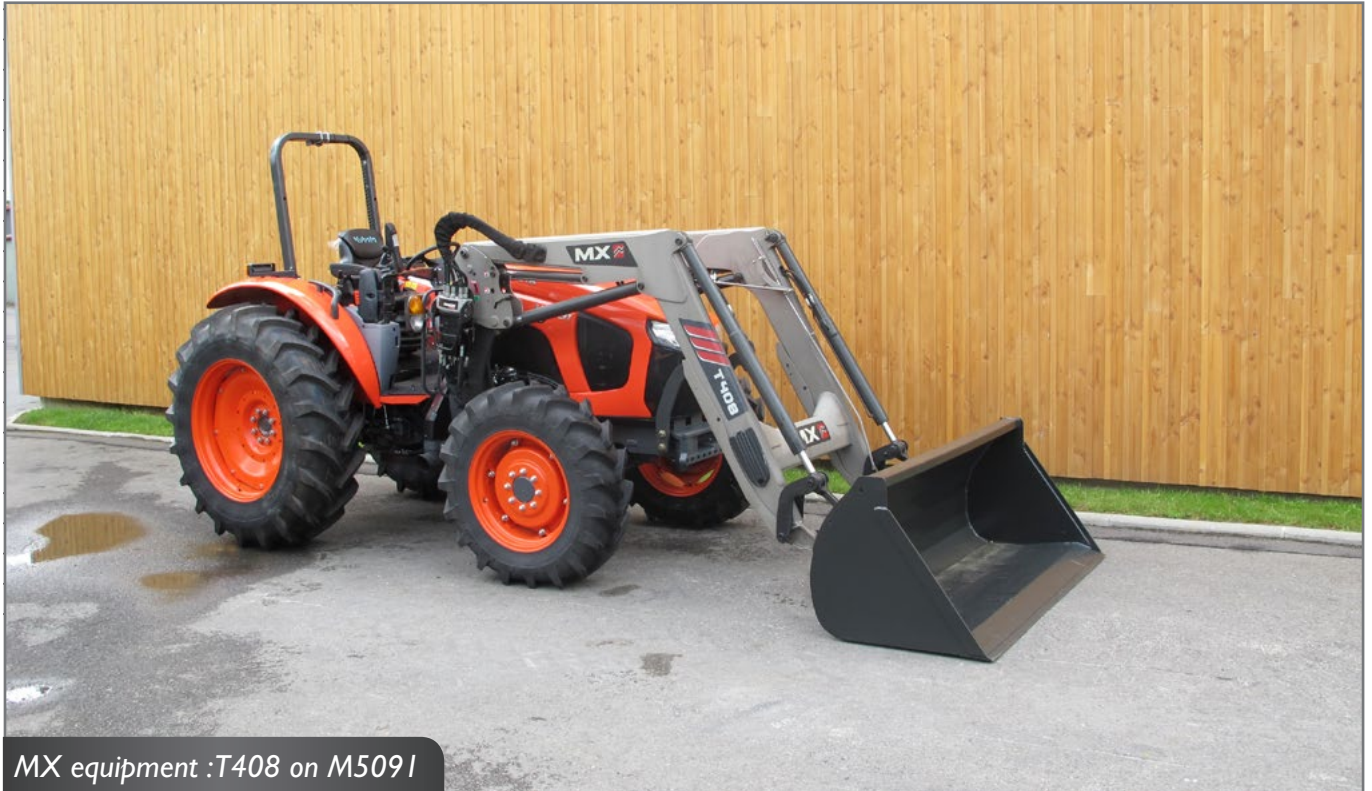
MX equipment : T408 on M5091