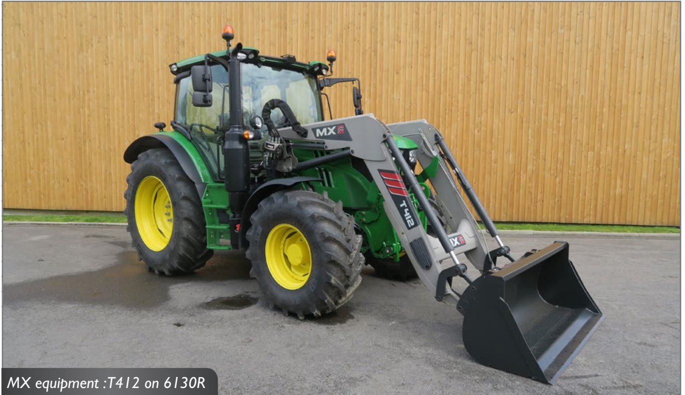
MX equipment : T412 on 6130R