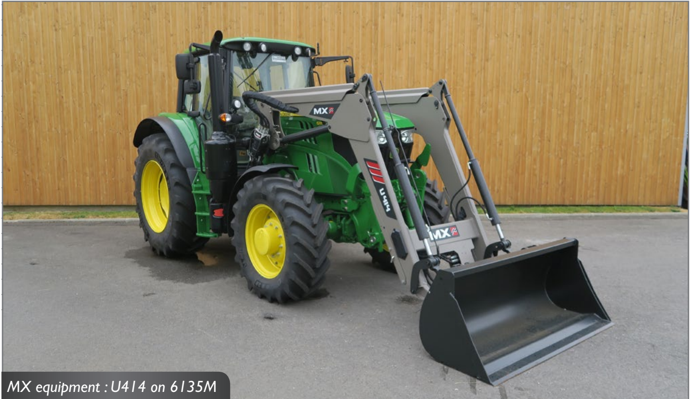
MX equipment : U414 on 6135M