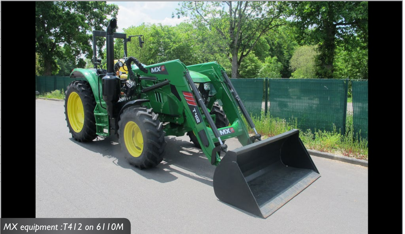
MX equipment : T412 on 6110M