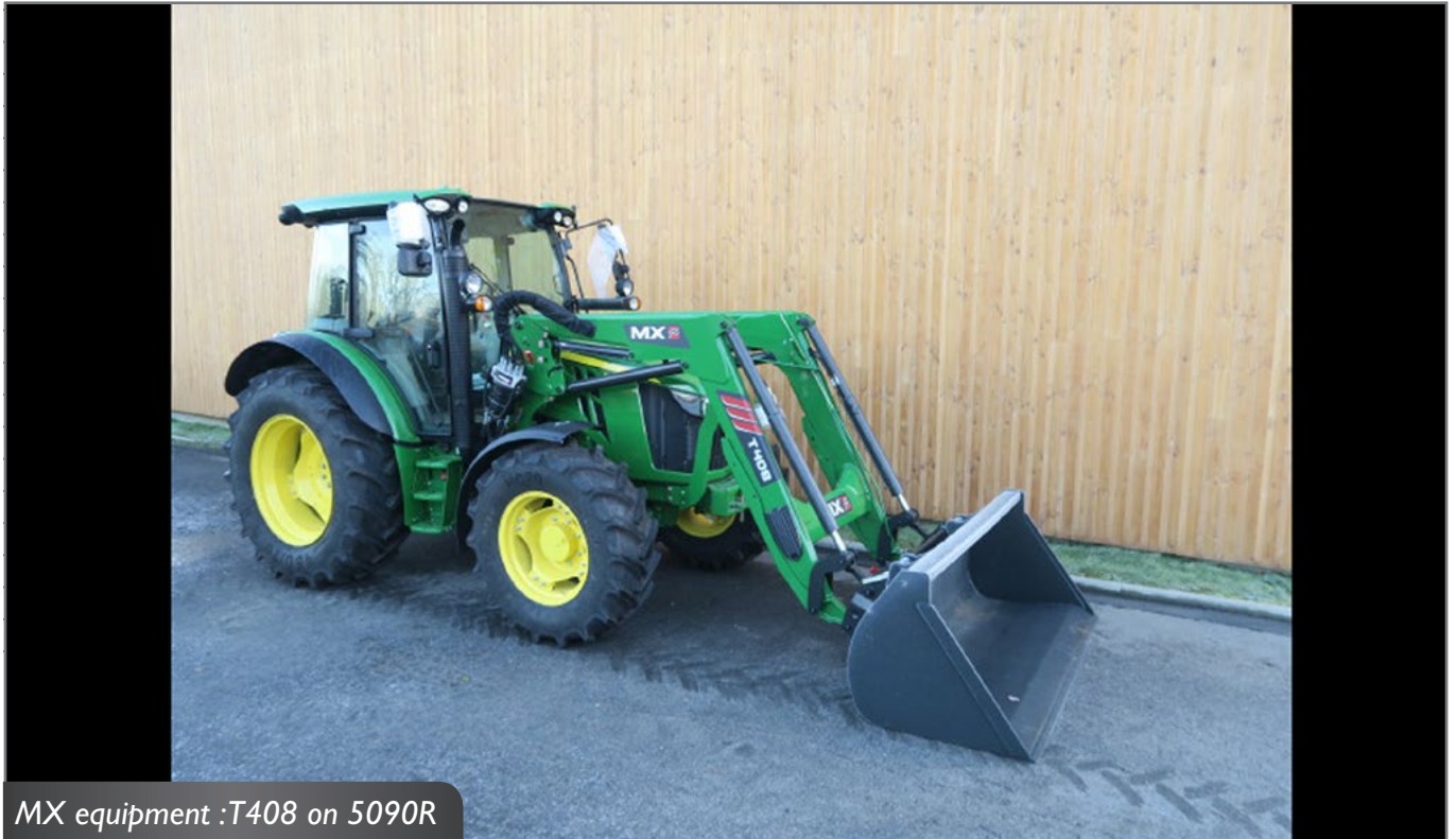
MX equipment : T408 on 5090R