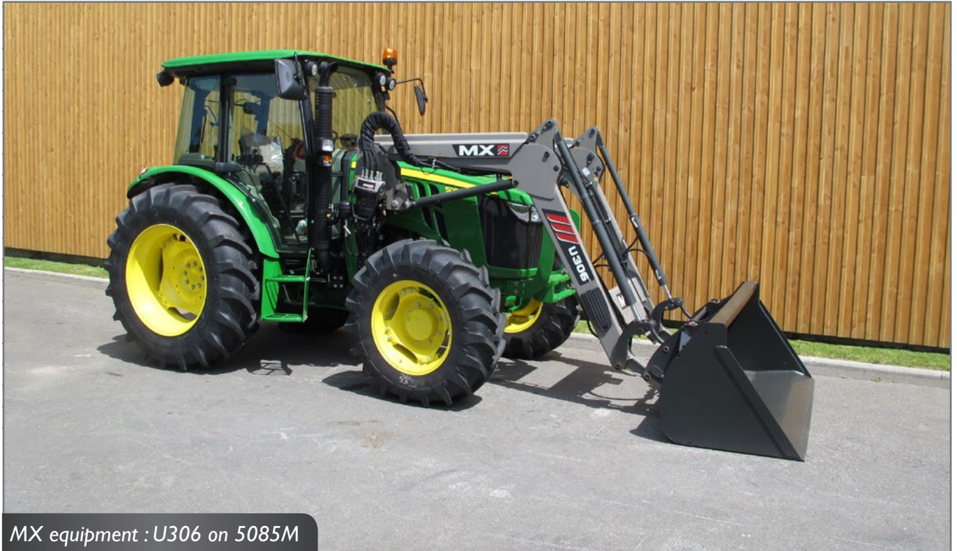
MX equipment : U306 on 5085M