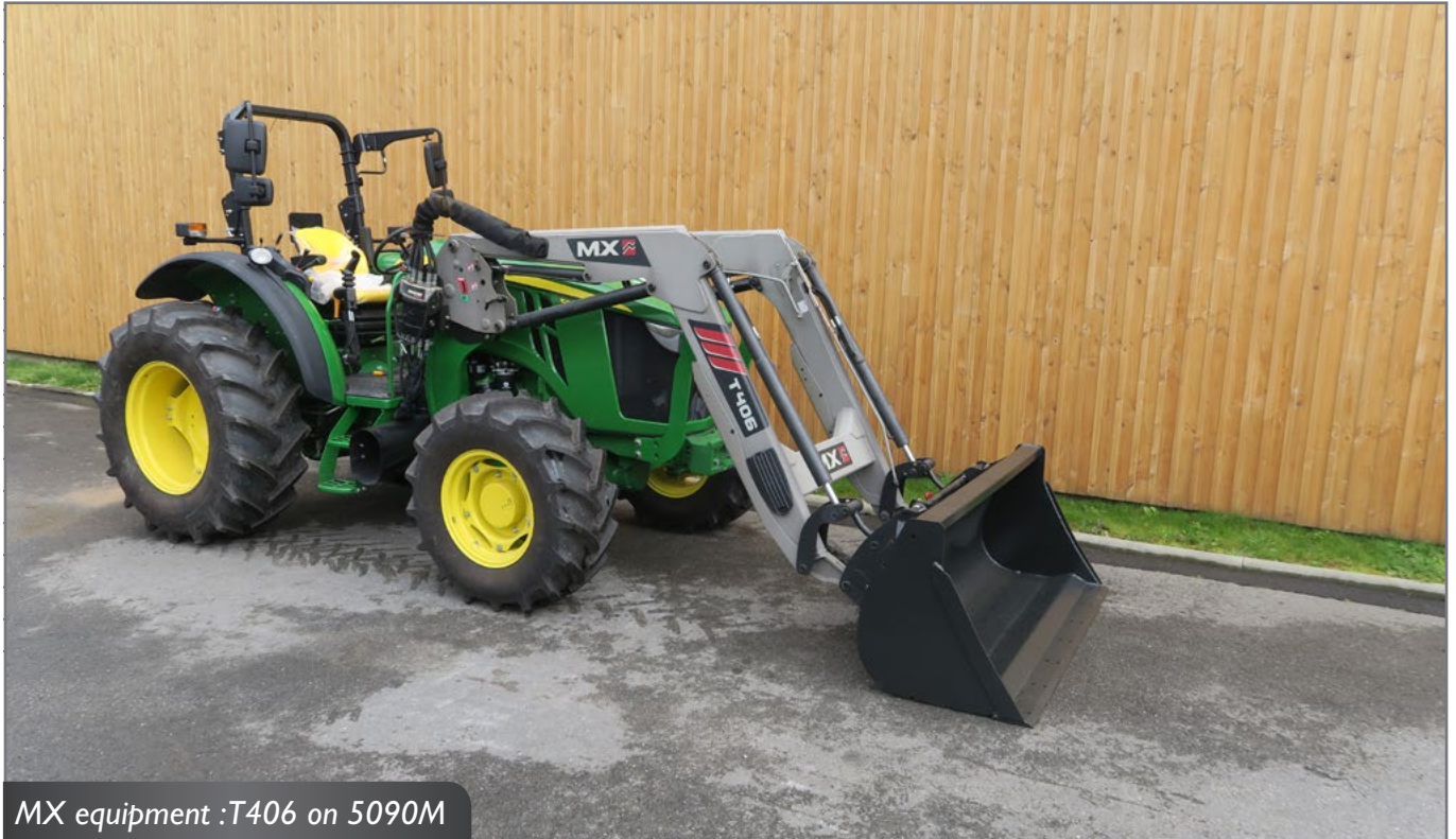
MX equipment : T406 on 5090M