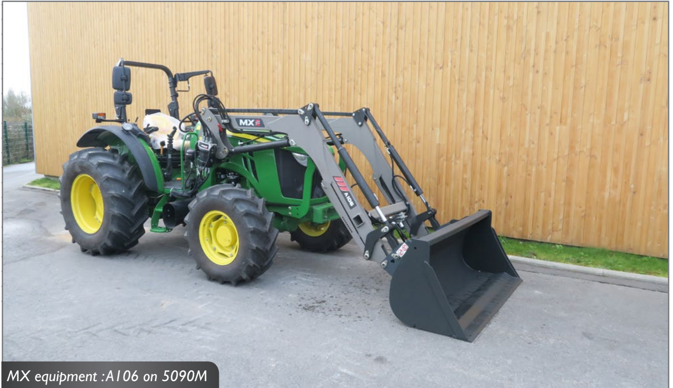
MX equipment : A106 on 5090M