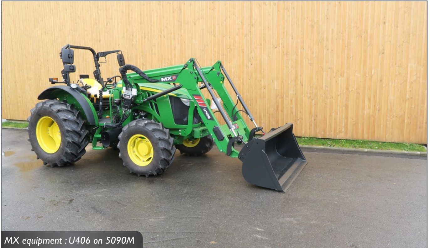
MX equipment : U406 on 5090M