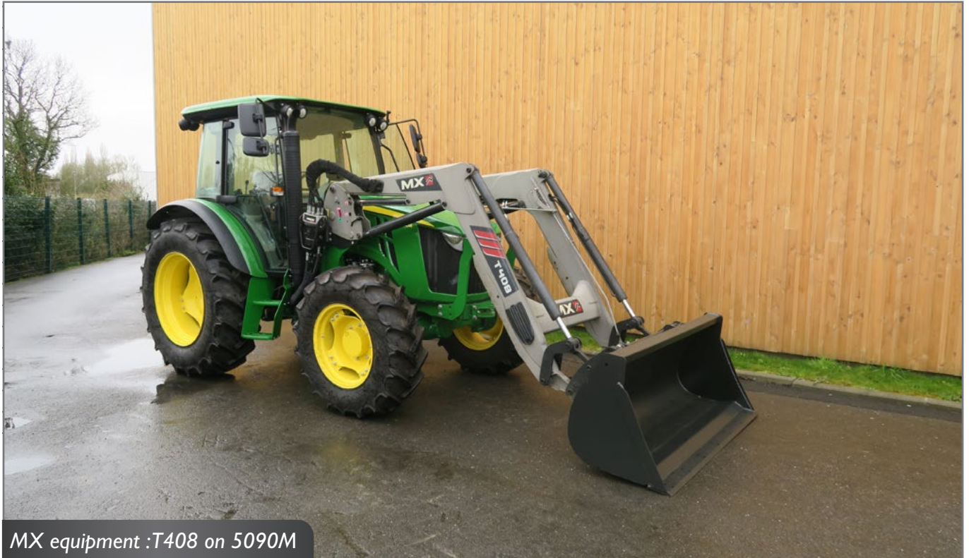
MX equipment : T408 on 5090M