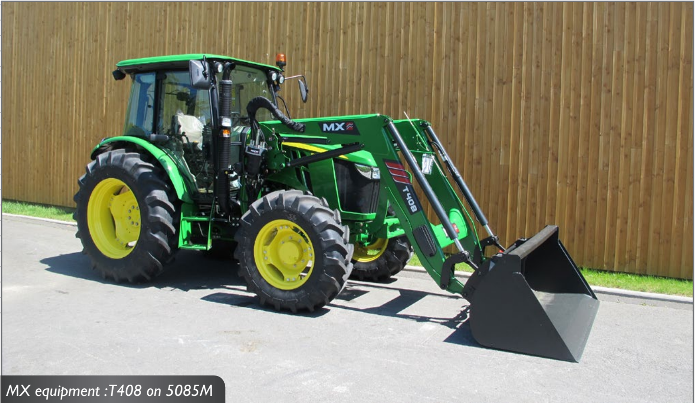
MX equipment : T408 on 5085M