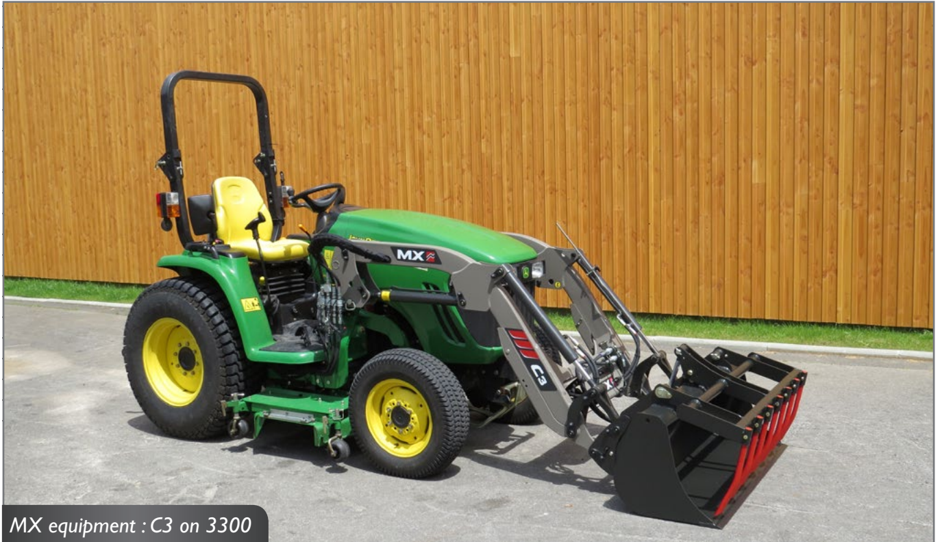
MX equipment : C3 on 3300