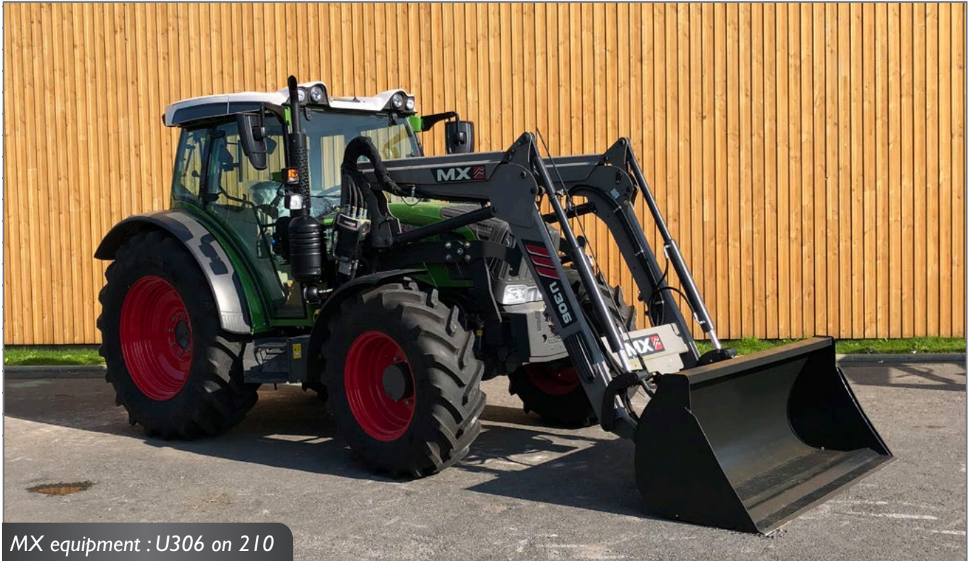
MX equipment : U306 on 210