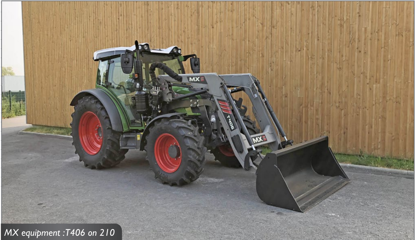
MX equipment : T406 on 210