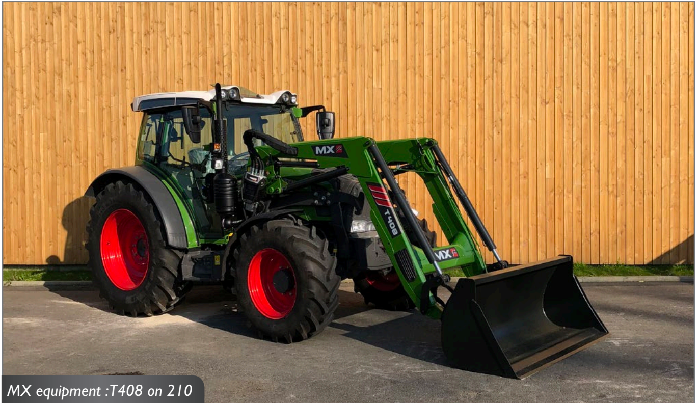
MX equipment : T408 on 210