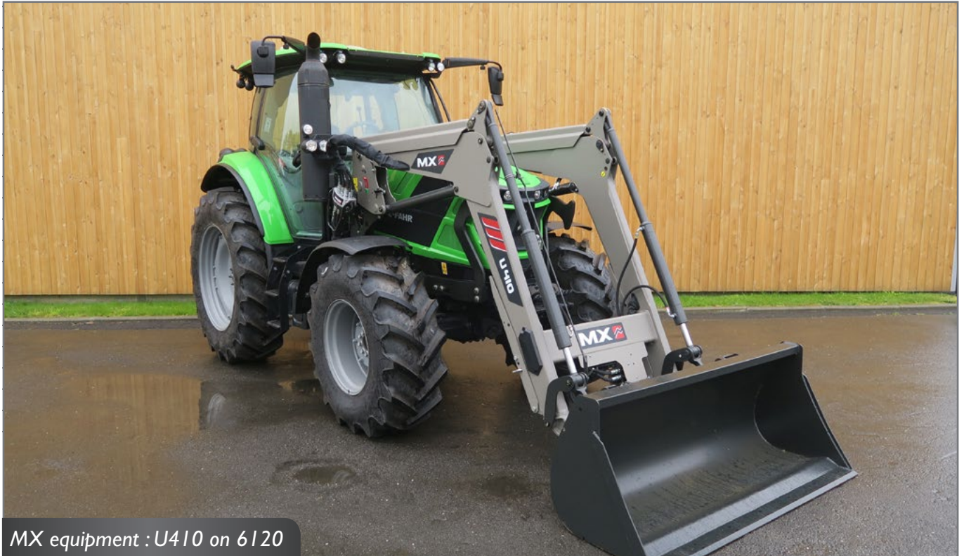
MX equipment : U410 on 6120