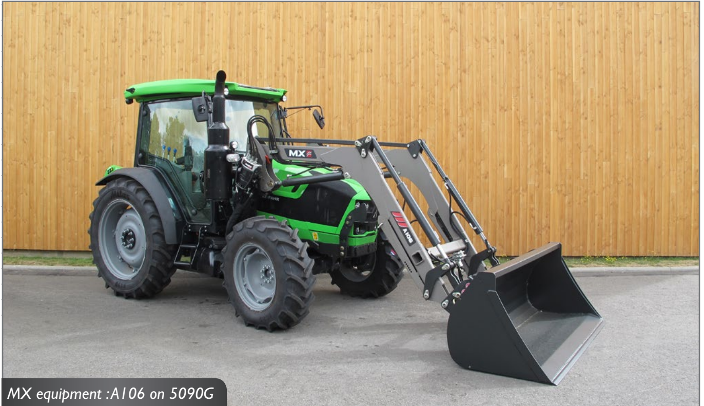
MX equipment : A106 on 5090G