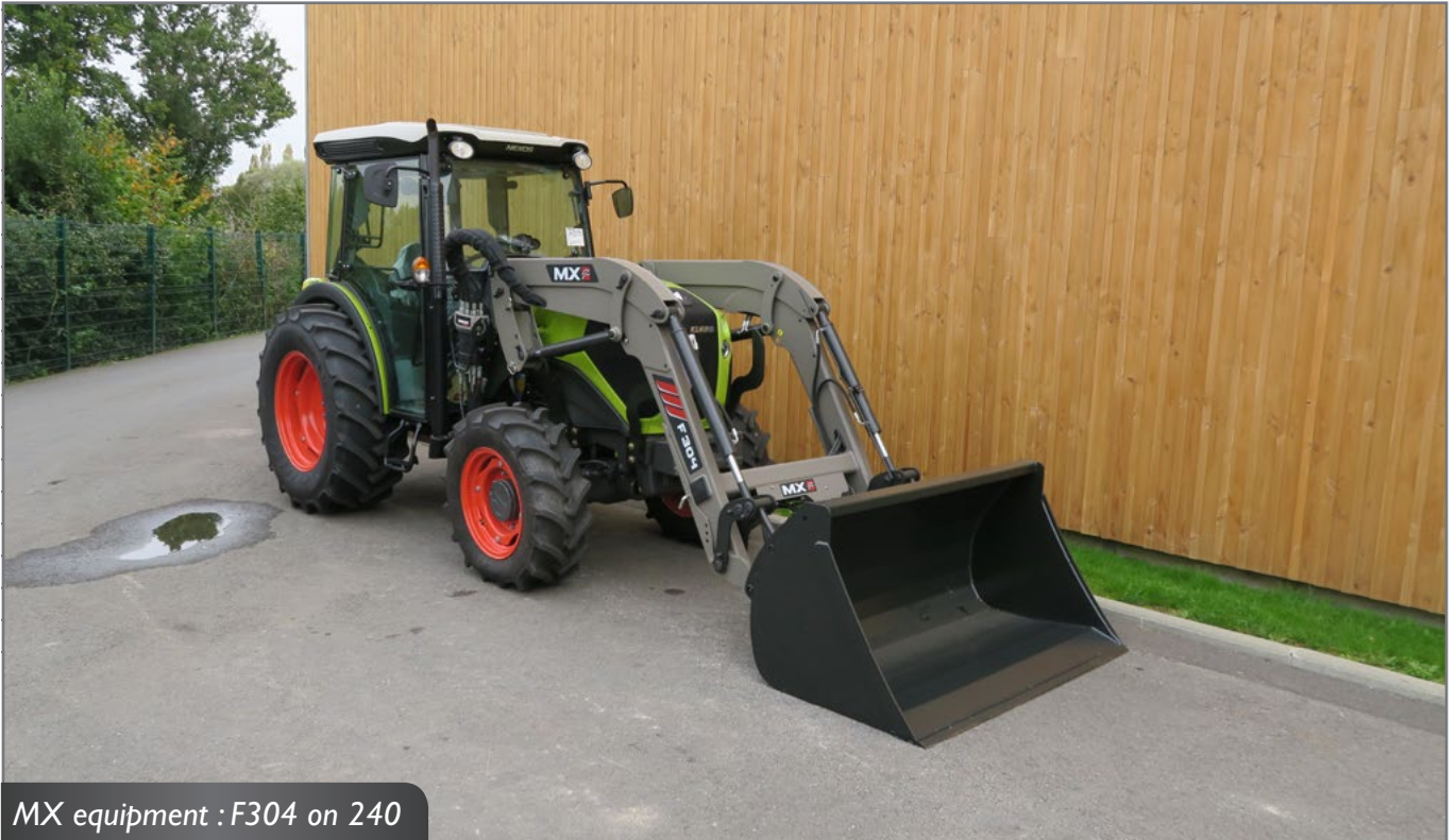
MX equipment : F304 on 240