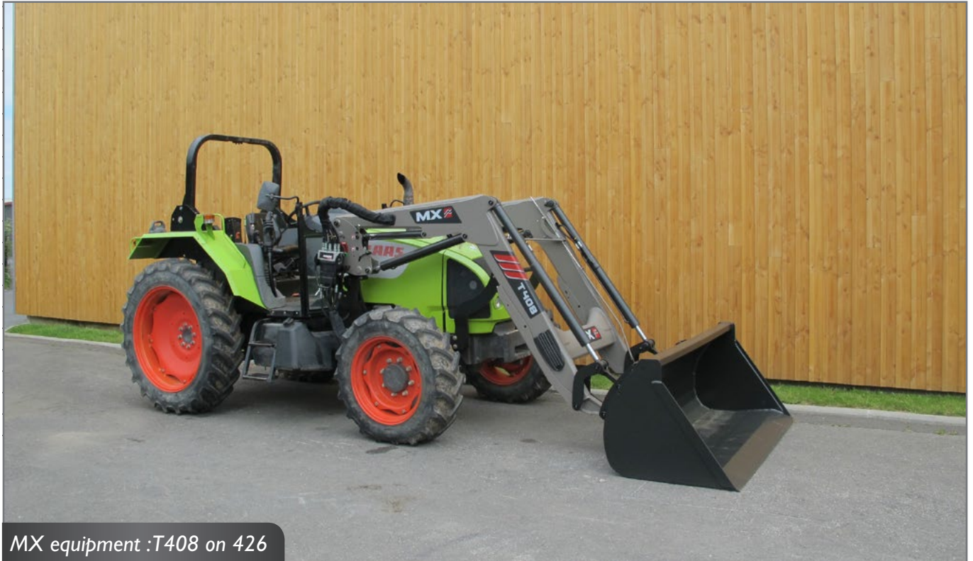
MX equipment : T408 on 426